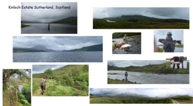
Kinloch Estate Sutherland, Scotland

The images are a couple of Power Point slides I've made as examples of how this might look. It's still too early to say this is it. They're provided to give inspiration and make you think about the projects and how you look at your time out fishing.