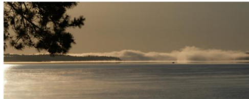
Portage Lake Houghton, MI

We are seeking photos of past BUFF events, members and activities for our 50 th Anniversary which will be celebrated in 2027. In addition, we'd like to do one or two regular meeting presentations highlighting our members fishing experiences with photos of those.