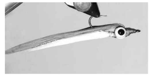
Marabou Shad Minnow—Clouser Style (wet)