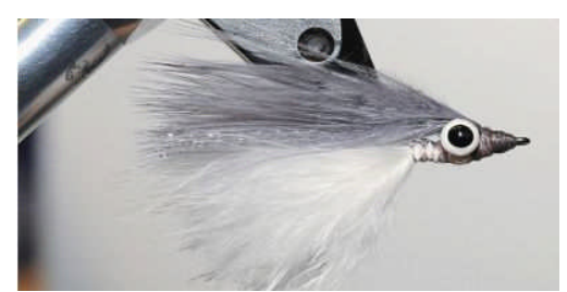
Marabou Shad Minnow—Clouser Style (dry)