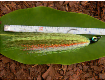
Levi's Struggling Baitfish