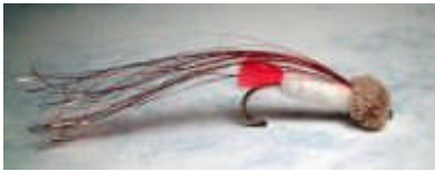
The Dahlberg Flashdancer!

Take a double edged razor blade and break it in half. Curve the blade in your hand and slowly trim the hair. You may trim either from the back to the front or both. Use small scissors to do additional trimming. Make a small cone like head and trim it flat on the bottom. The head may also be trimmed to leave a collar on the upper half.