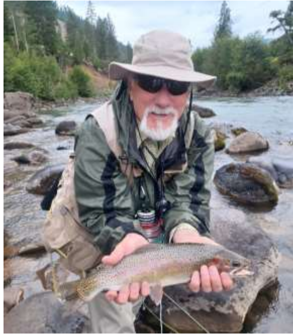
Here's a nice fish!