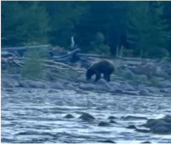
A fishing buddy!