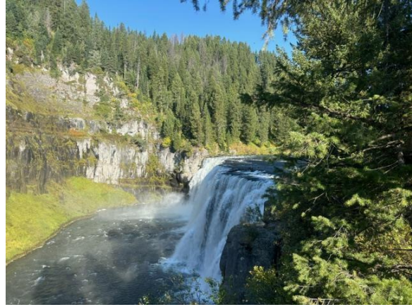
Upper Falls of the Henry's Fork