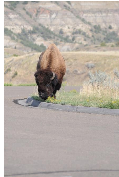
Wild Horses & Buffalo in Theodore Roosevelt Nat'l Park & Box Canyon on the Henry's Fork