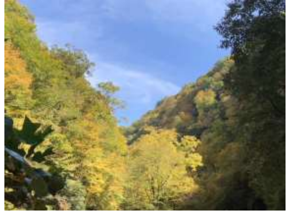
A couple of nice photos of scenery