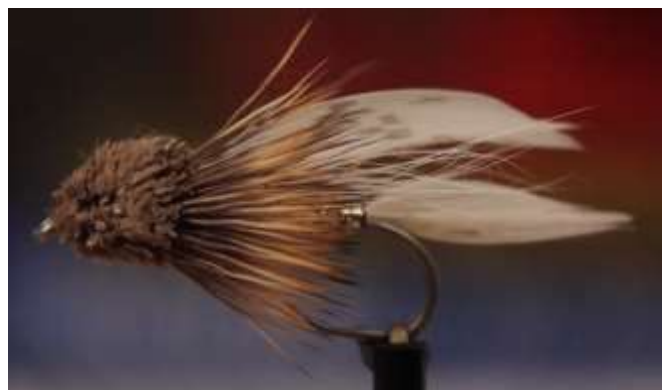
Muddler Minnow Pattern