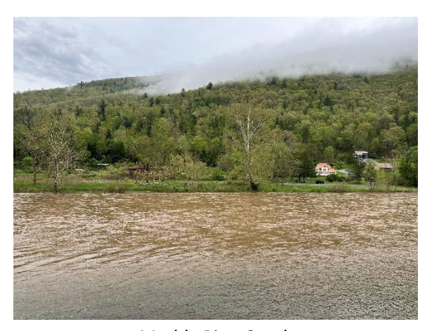
Muddy Pine Creek