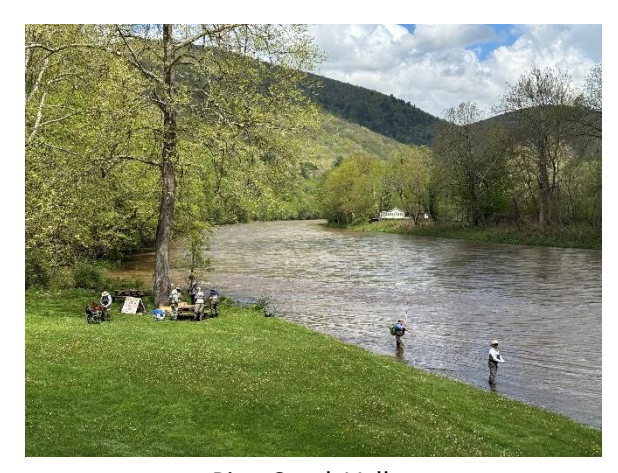
Pine Creek Valley