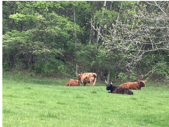
One of the farms raised longhorns