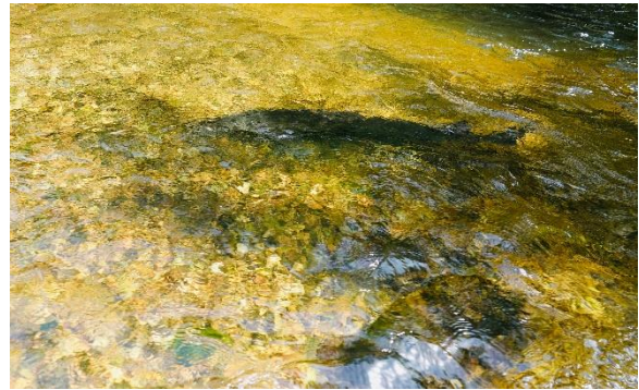
The dark shadow is a 4-5 foot Sturgeon

We stayed at the Muskegon River Inn. Its in the middle of Newaygo and was about a 10-minute drive to our boat launch. The inn is a small hotel (about 7 rooms) and quite reasonable, and a great place to stay. The rooms were immaculate, it had the best shower I've ever experienced, and they gave us breakfast each morning and homemade snacks (cookies, scones, etc.) each evening. There are nice restaurants in the area. We ate 2 nights at an excellent brew pub next door to the hotel, and a superb restaurant about a 15 minute drive from town on the last night. All in all, we had a 4-star experience for lodging and dining.