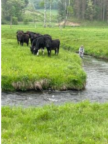
Companions by the stream