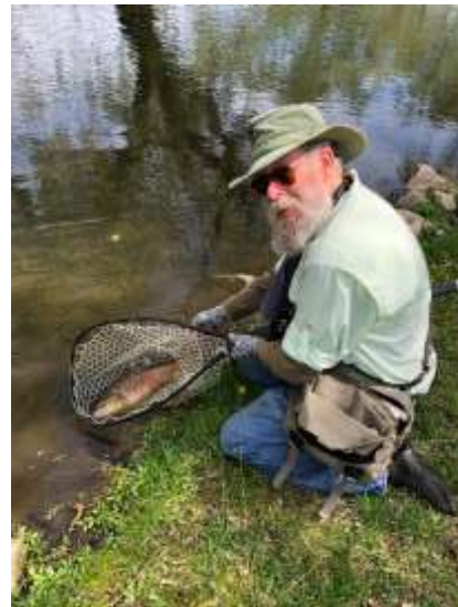
Caught this one with my Tenkara Rod