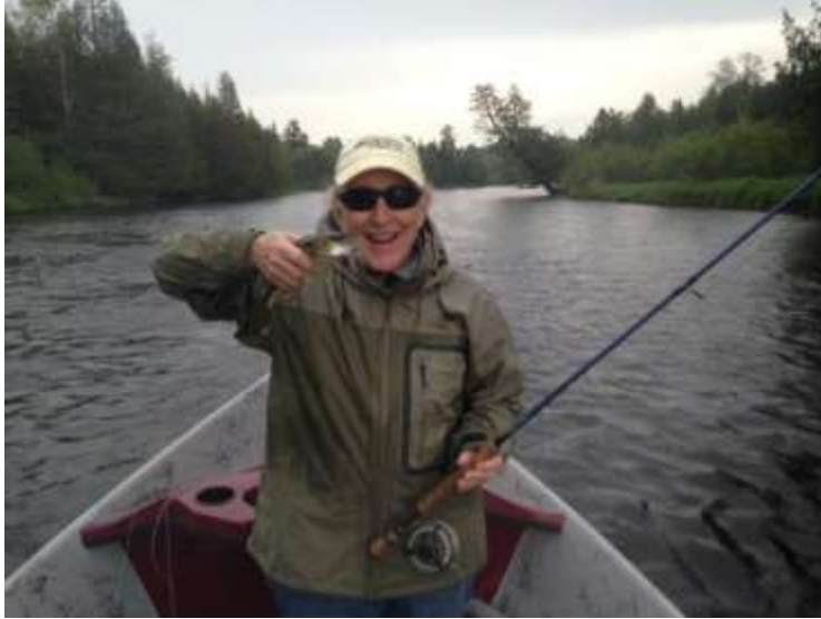
Yes, that's the trophy waters of the Au Sable