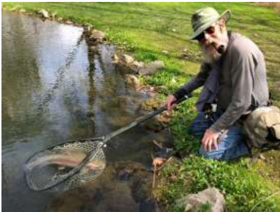
The big one that didn't get away

For those BUFF members who have not taken the opportunity to participate in one of the Sunnybrook trips, it is an activity well worth considering. A fun time with great fishing and a great group of fellow BUFFERS.