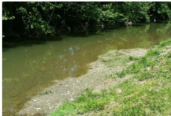
Banklick Creek at Pioneer Park

In July we will be having our annual joint meeting with NKFF. It will be held on Thursday, July 10 , at Pioneer Park located at 3951 Madison Pike, Covington, KY 41017, which is easily accessible from I-275. We will be using the main shelter house (turn right after entering the park). The official meeting will start with a social hour at 5:00 PM followed by dinner at 6:30 (fried chicken, two sides and coleslaw plus drinks). The program for the evening will be a presentation by NKFF members on warm water fishing techniques plus casting clinics. This will be a swap meet so bring anything fly fishing related you would like to pass along to someone else. Cost will be $10 and you must register (using the BUFF on-line registration) prior to July 5 (attendance is limited). If you wish, come early and fish Banklick Creek which is adjacent to the Park. The Creek is small and wading is prohibited so be prepared to do roll casts from the bank (a Kentucky Fishing License is required).