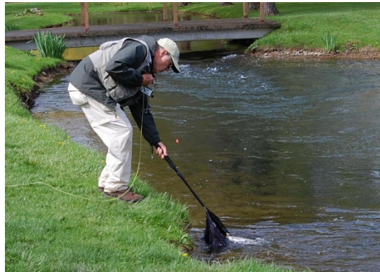
Sunnybrook Trout Club BUFF May Trip