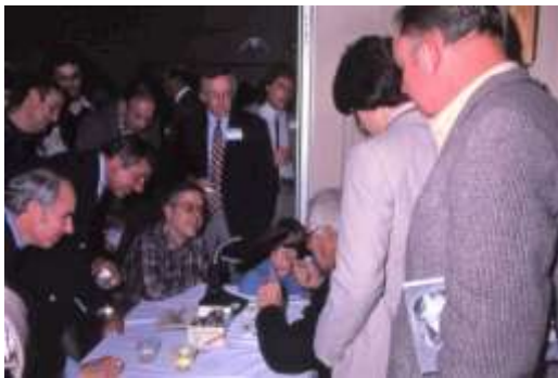
Tying demo by Lee Wulff at the 1982 show