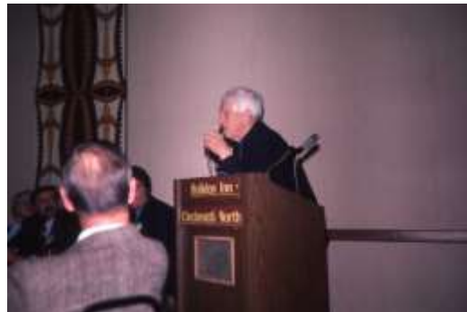
Lee Wulff -1982 Banquet Speaker