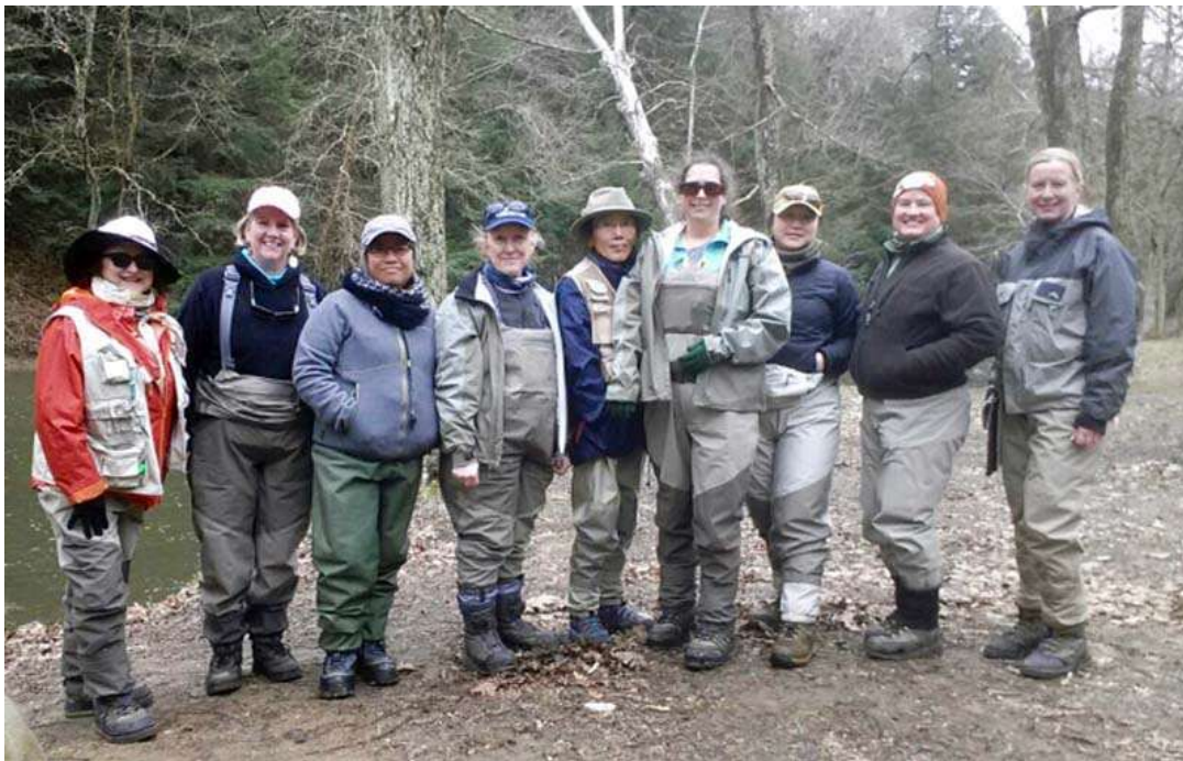
Cast of Characters from the 2018 Spring Trip

Feel free to contact Cari Vota if you have questions or need more information.