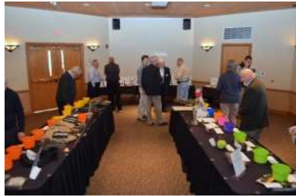
Raffle items at 2018 Banquet

The banquet will be Wednesday, March 13 th , 2019 from 6 – 9 PM at the Ronald Reagan Lodge in Voice of America Park.