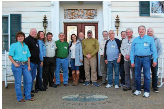
The Workshop Attendees

The workshops were great and enjoyed by all. The B.U.F.F. guys added in a little fishing as well. Those that went up on Friday fought high winds, rain and cold temperatures for the honor of trying to catch a few elusive trout. Those fishing Saturday and /or Monday had better weather but with bright sunlight and super clear water (think being able to count pebbles in the 13' deep holes) fishing was still tough. The fish were feeding but were very selective. As always, the facilities and food were top rate at Sunnybrook and the staff took great care of us.