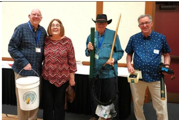
Winners of the Grand Raffle Prizes