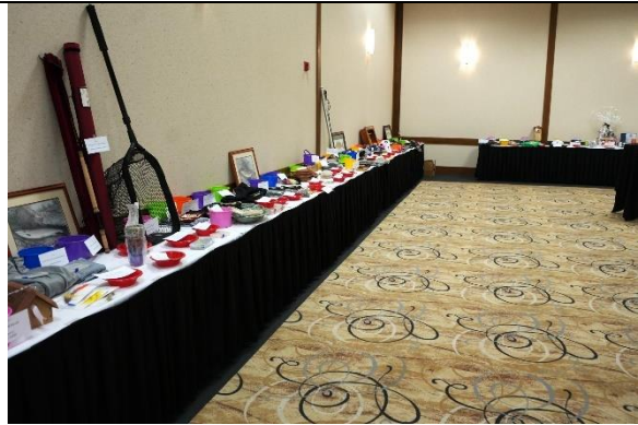
Some of the Raffle Prizes