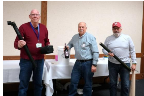
Our Grand Raffle Winners!