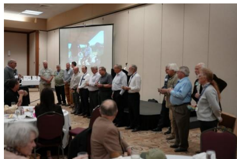
Swearing in the 2023 Board