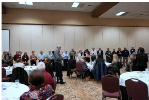
Thanking our volunteers