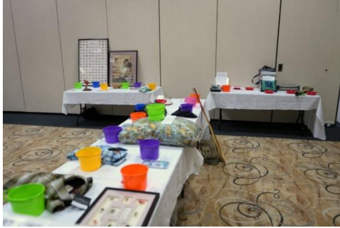
Some of the many raffle items