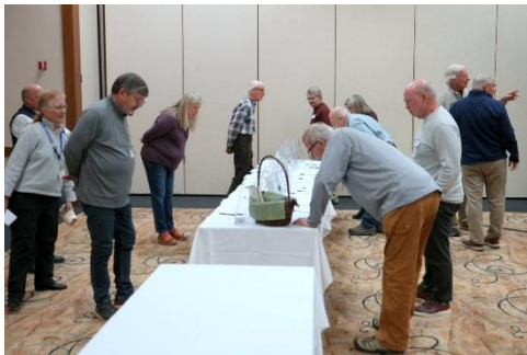
Bidding for silent auction items