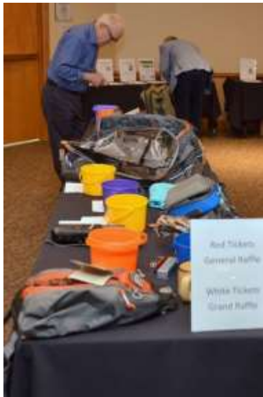
Some of the Raffle Items and Silent Auction Items