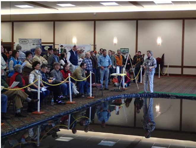
2014 Fly Fishing Show Casting Pond