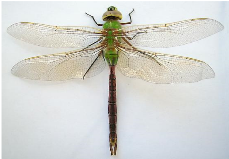
Common Green Darner

Perhaps the dragonfly got its bad reputation because instead of buzzing around like flies and mosquitoes who flap their wings a noisy 300 to 900 times a minute the dragonfly sneaks around by flapping its wings a stealthy 30 times a minute yet can move at an amazing 45 miles an hour and can hover, or fly up down, or side to side. Instead of being evil dragonflies are good to have around because a major part of their diet consists of mosquitoes and black flies that are consumed in prodigious amounts while underwater as nymphs and later as adults when they capture their prey in midair; a maneuver that earned them the moniker "Mosquito Hawk". They are plentiful, and Ohio has more than 164 individual species with the Common Green Darner among the most prevalent. This specie is one of very few dragonflies to migrate with the seasons and produce two distinct hatches in different parts of the western hemisphere. In the fall many of them will gather in huge swarms and fly south to Mexico or the Caribbean. The offspring from the southern migration will head north as the weather warms to start a second brood of dragonflies that will make the