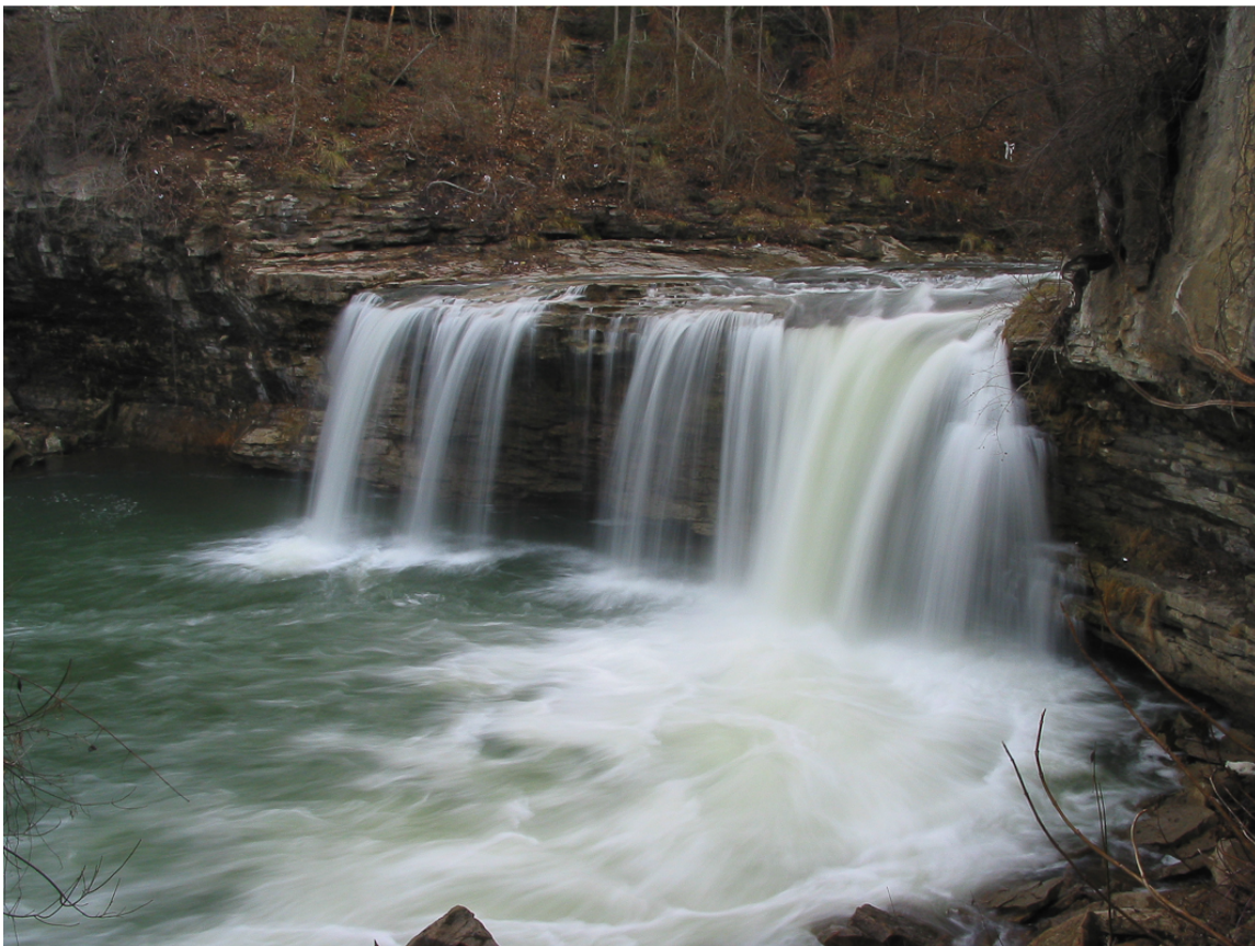
Paint Creek Watershed, Highland County, Ohio

Niagara is the second largest falls in the world, surpassed only by Victoria Falls in southern Africa. Wikipedia