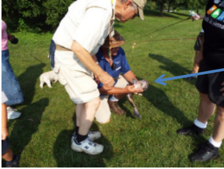
Here's the nice catfish. And here's the boy who caught it.